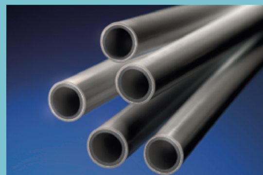
MULTI LAYER PIPES